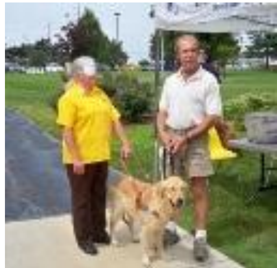
???? (Story, p. 8)