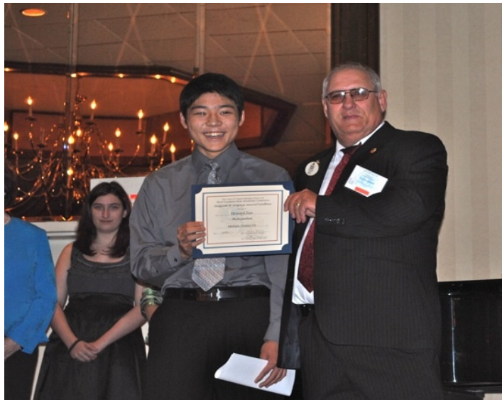
At the Bland Concert with a 24C participant