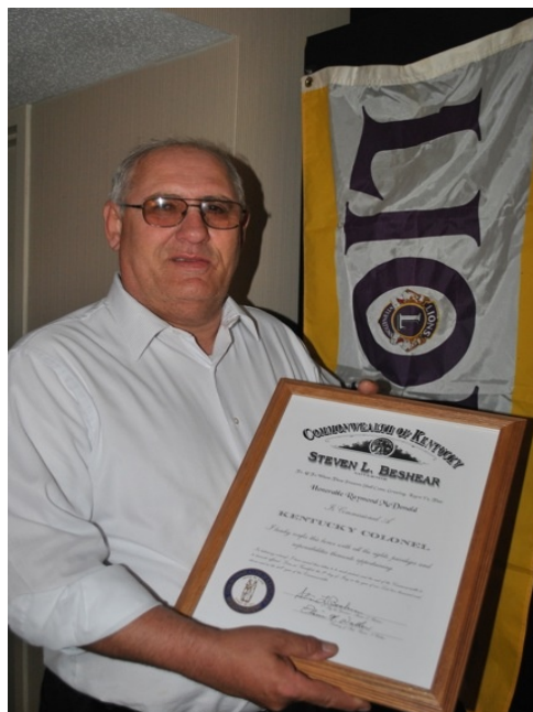
24C's Newest Kentucky Colonel